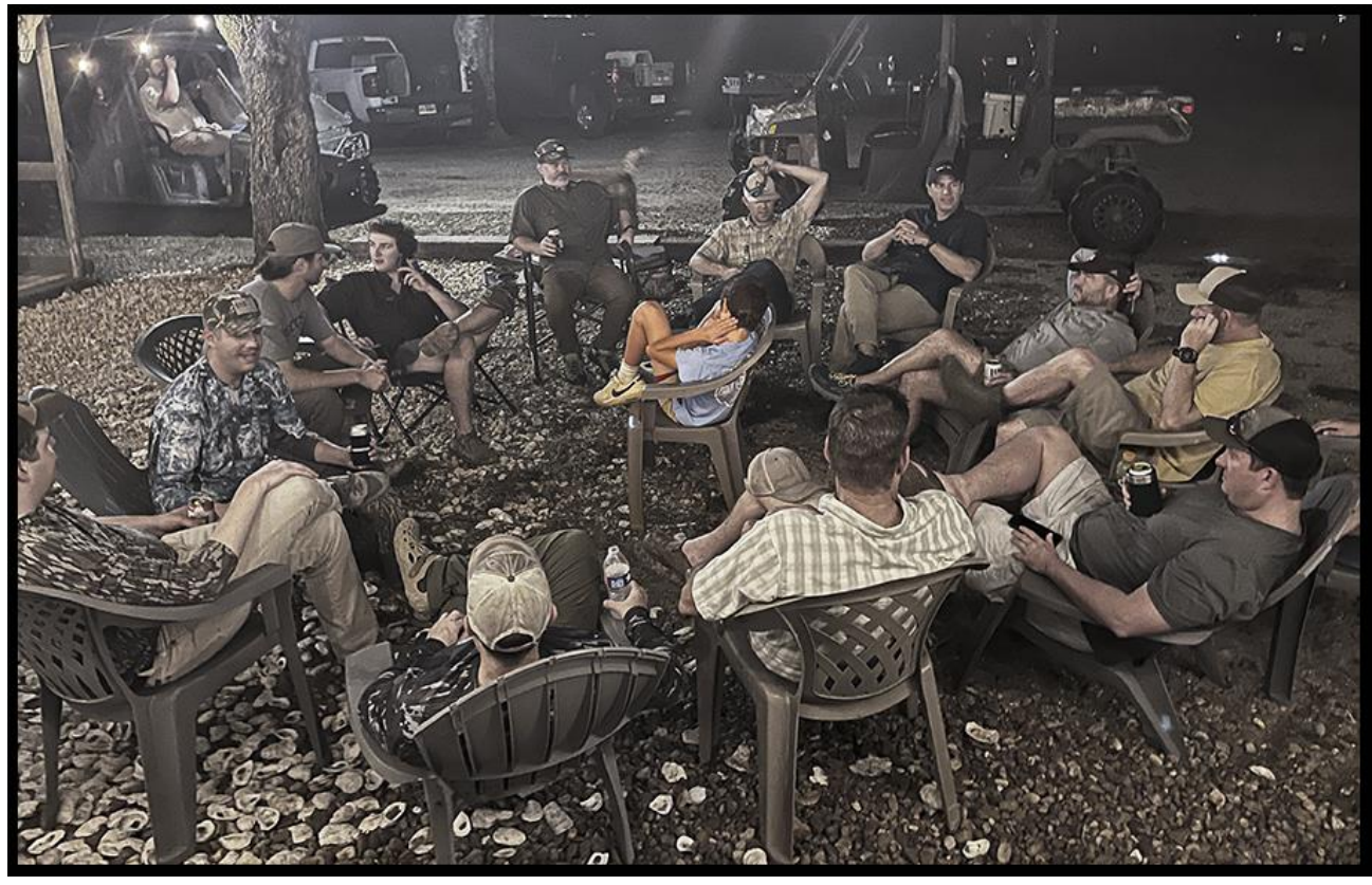
This Young Lad Seems "Enthralled" with All the Campfire Swaggering Friday Night