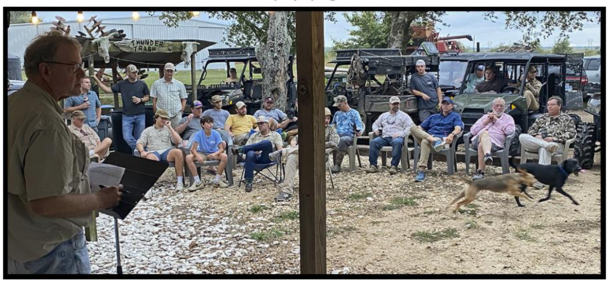
The "Preacher" at the Pulpit