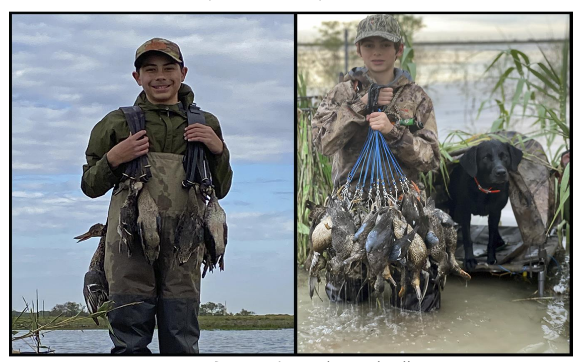
Case Reeves & Starks Cockrell

\underline{www.ThunderbirdHuntingClub.com}