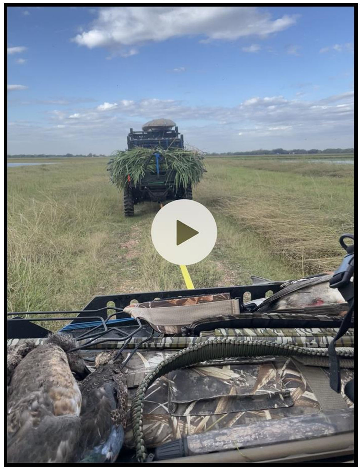
And Yet Another ATV Breakdown, Good to Have Friends with Long Tow Straps