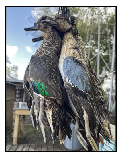
Greenwings & Bluewings Equally Abundant This Weekend