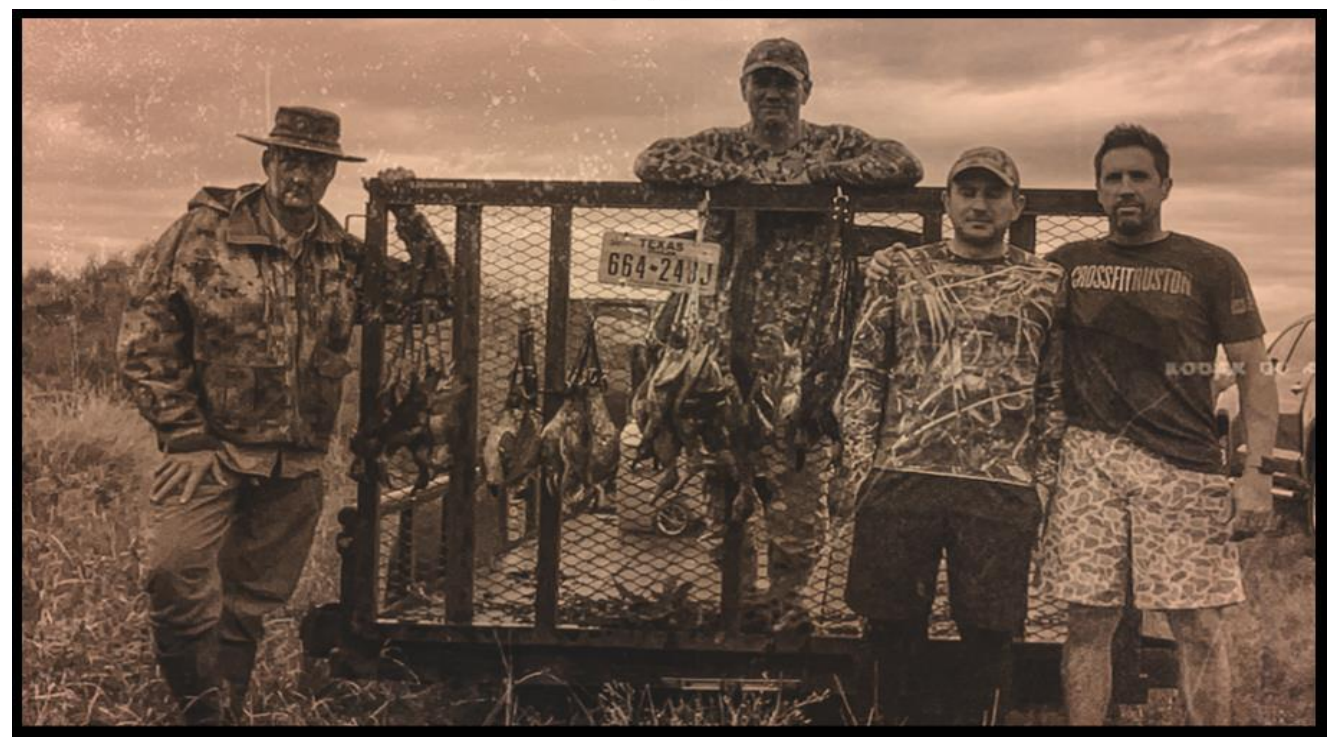
The OM Marsh Rats