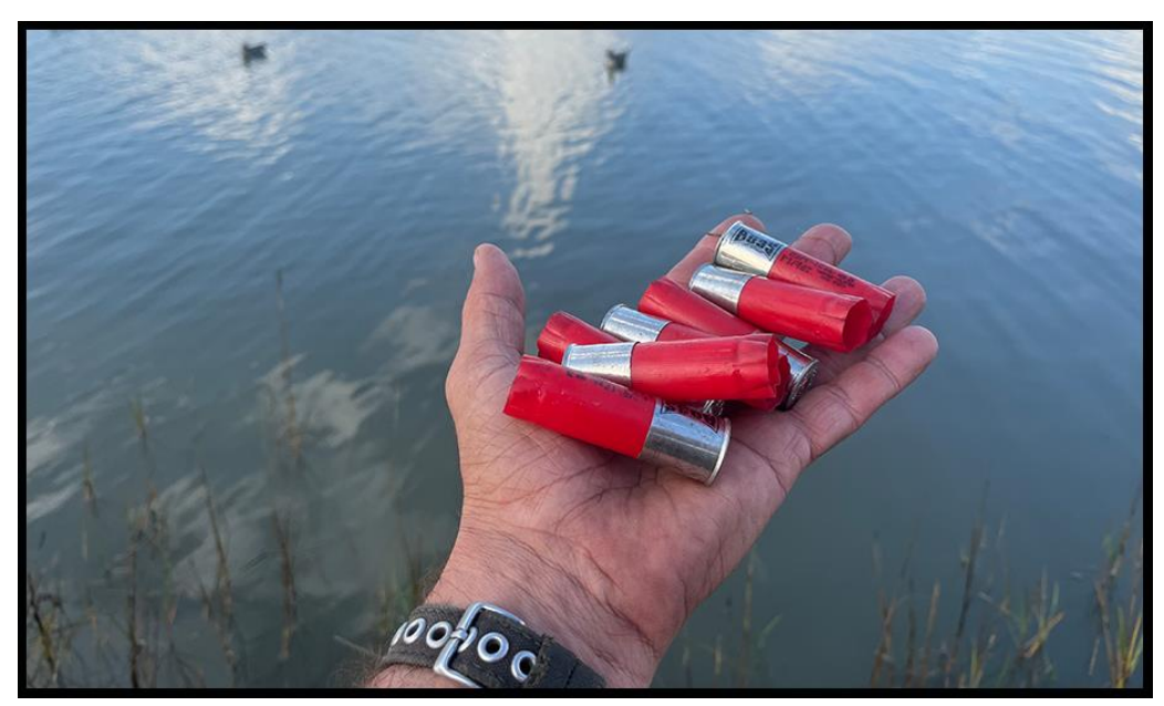
More Swaggering, Six Ducks with Seven Shells