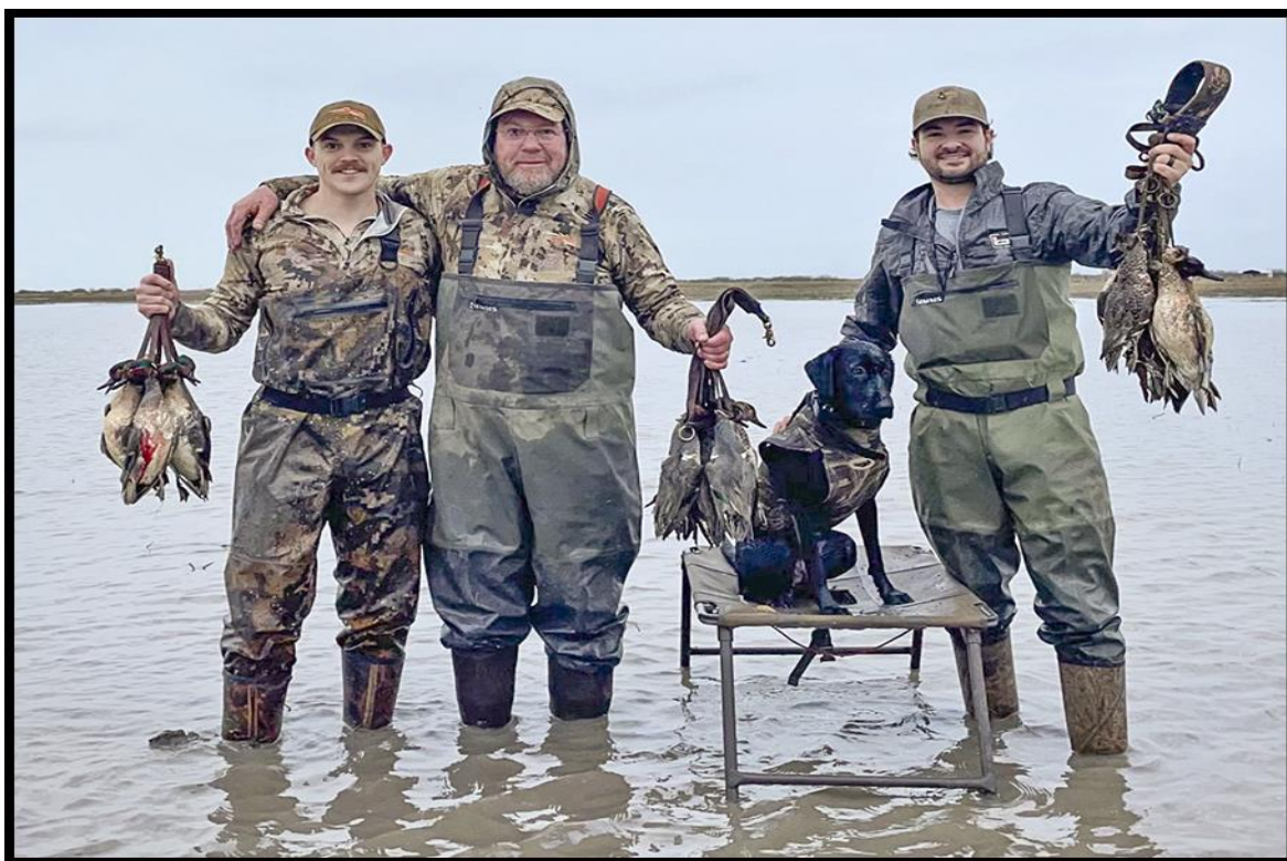
Benelli Pond Limits - Saturday