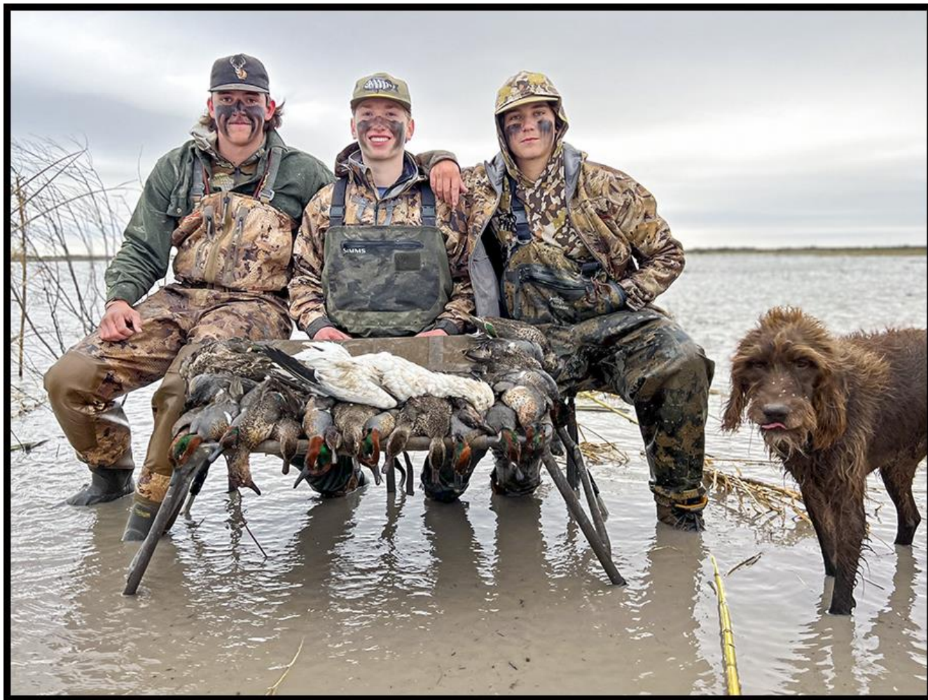
Thunder Pond - 22 Ducks & 1 Goose - Saturday