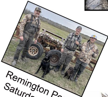
Remington Pond Saturday Limits