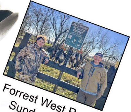
Forrest West Pond Sunday Limits