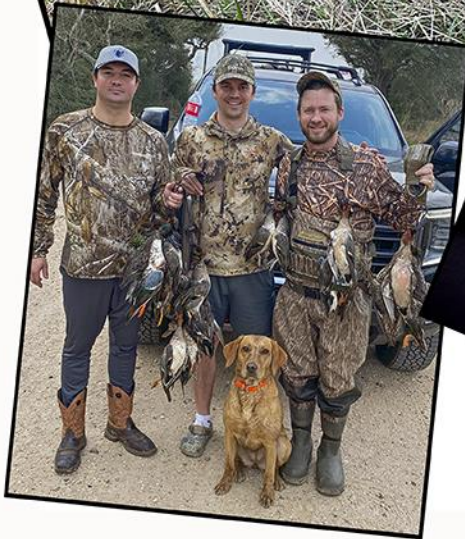
Shoveler Pond Limits