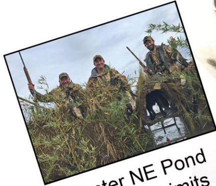
Hunter NE Pond Saturday Limits