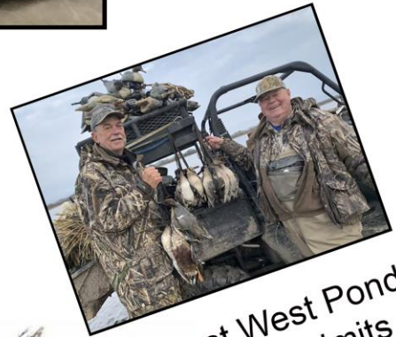
Forrest West Pond Saturday Limits