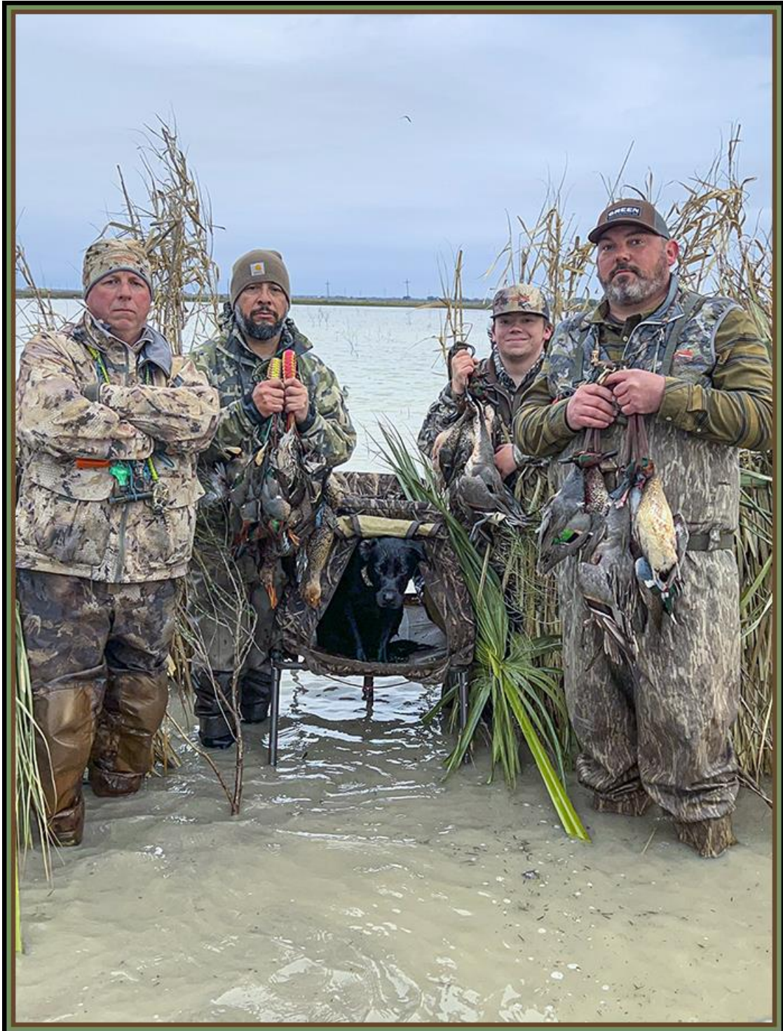
"Serious" Saturday Limits from the Gadwall Pond