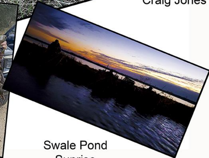
Swale Pond Sunrise