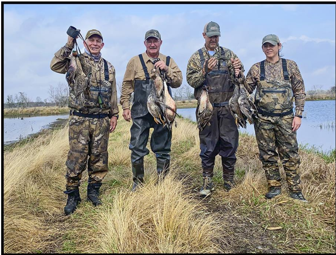
Hunter NE Pond Limits - Wednesday