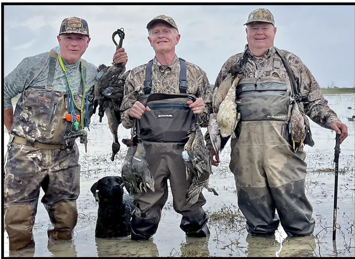
Mallard Pond Limits - Wednesday