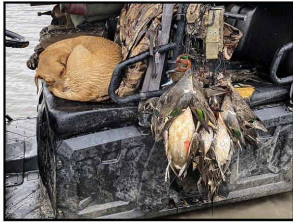
One Tired Puppy Dog